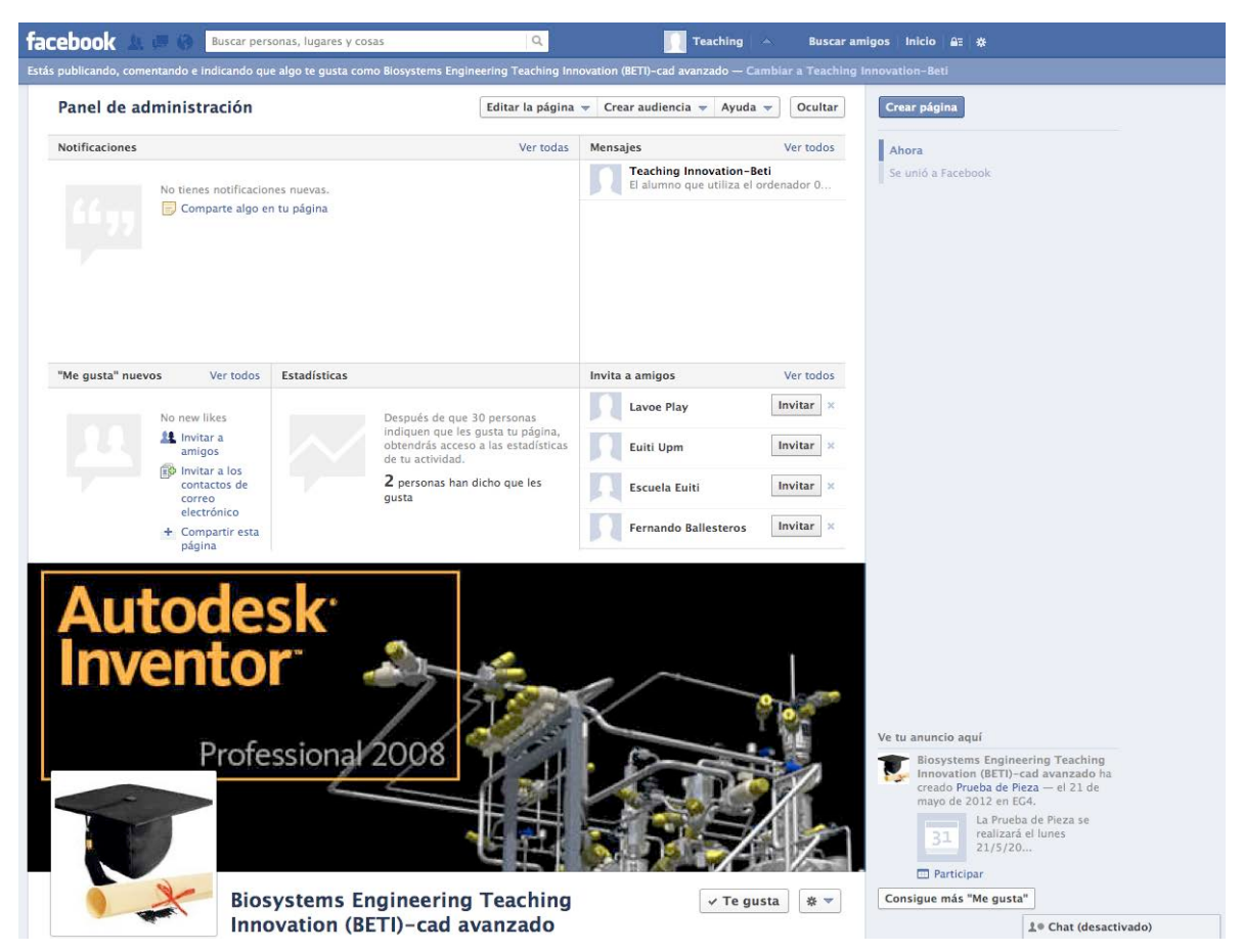
Fig. 2. Administrator profile of the virtual site created in Facebook for the subject CAD Avanzado.

After selecting the social network to be used, a virtual space was opened in Facebook for the subject 'CAD Avanzado', in which lecturers that participate in the development of this teaching innovation project gave lectures. The different options used were the 'Facebook wall', 'notifications', 'messages', 'chat' and the bottom 'I like it'.